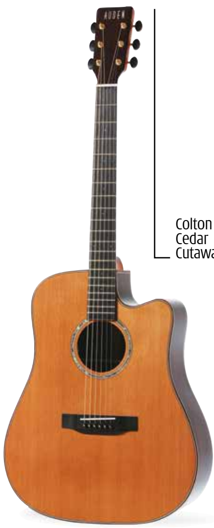
Colton Cedar Cutaway