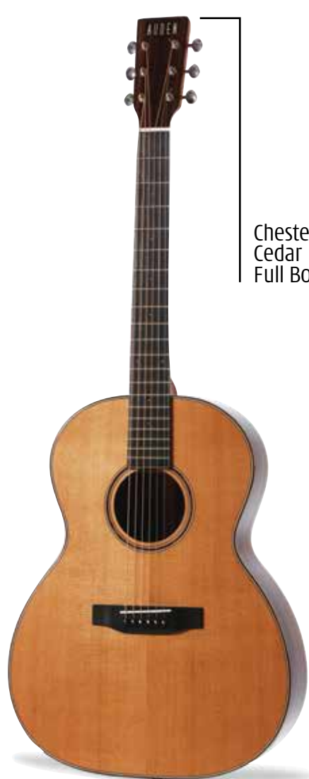
Chester Cedar Full Body