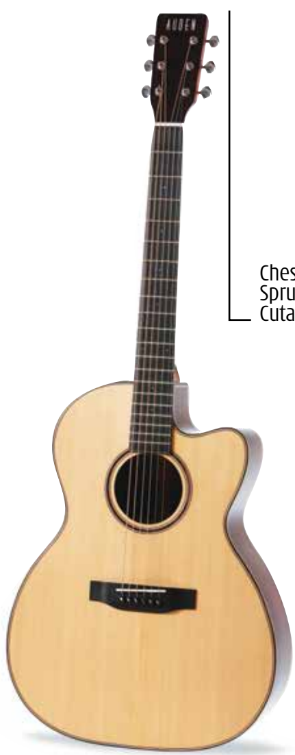
Chester Spruce Cutaway