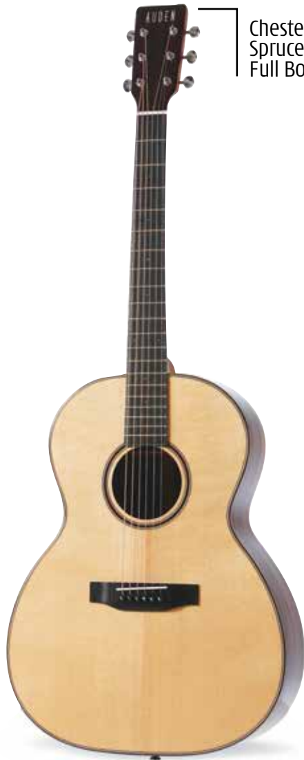
Chester Spruce Full Body