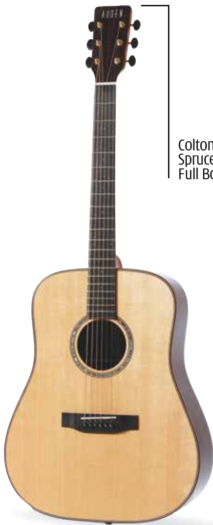
Colton Spruce Full Body