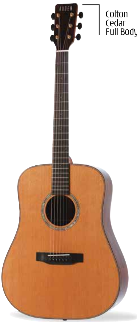
Colton Cedar Full Body