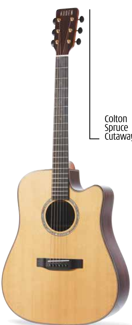
Colton Spruce Cutaway