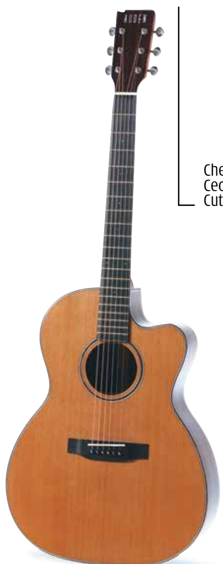
Chester Cedar Cutaway